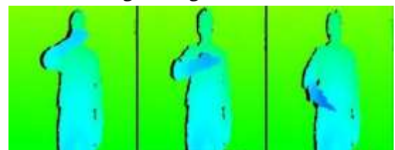
Fig4. "I am"

This system will capture motions and convert them to text. For instance, if the user wants to mention "I am good", gesture will be: