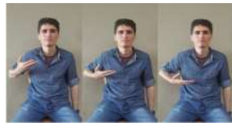
fig2. "I am"

In this part, .gif images are used to display on the screen to show the proper meaning of the text. For example, if the user wants to say "I am a doctor", the system will display given images.