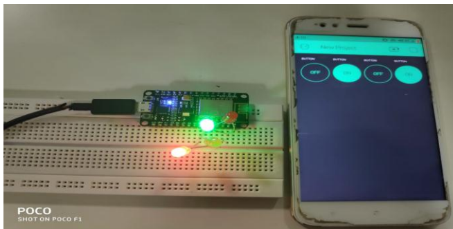
Fig -2: Wi-Fi module with Android application (Blynk app)

To provide a safe and secure path for the national security vehicle. An android application will be provided for an authorized person who is in charge of the safety services. The authorized person will be sending the signal to the PLC with the help of the Wi-Fi module to clear particular lanes this is done prior by blocking all the other lanes so that the escorts service can clear the traffic and pass safely after the operation is being completed conventional traffic takes over. Refer to Figure 2.