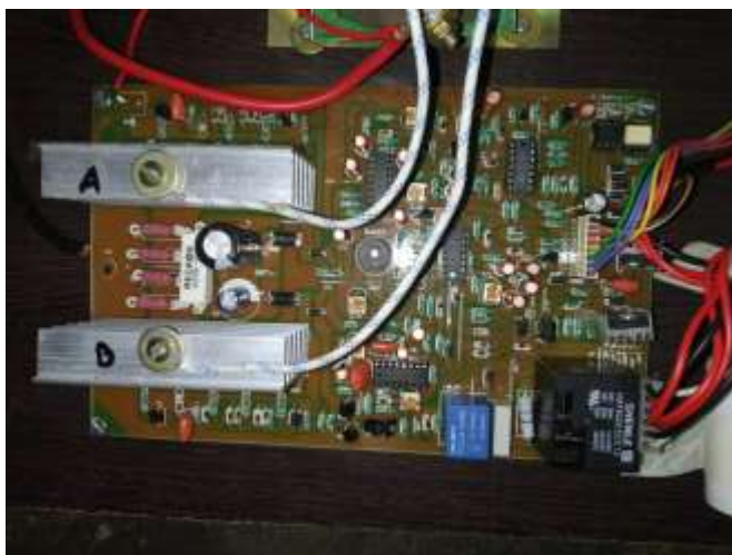
Fig 2: Actual Working Model fig 1