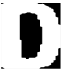
FIG: 15 D.bmp