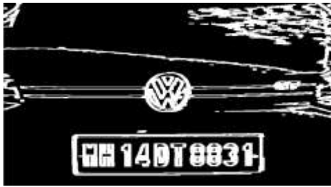
FIG: 7 Dilated image