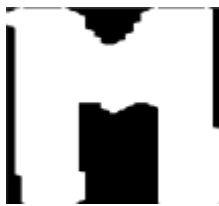
FIG: 11 M.bmp