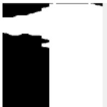
FIG: 13 1.bmp