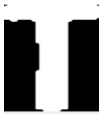
FIG: 16 T.bmp