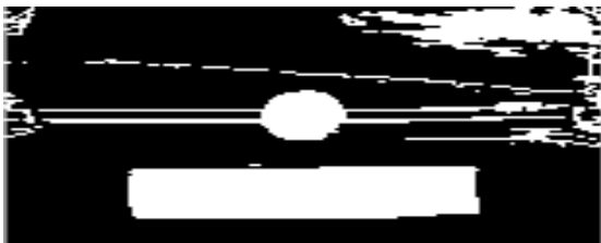
FIG:8 Eroded image

In order to make the segmented object look natural, the image is eroded with the structuring element. This extraction process helps in extraction of number plate area of the vehicle. This erosion operation also helps in removing the connected objects to the border of region of interest.