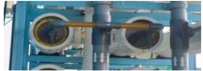
Fig2: Reverse osmosis setup