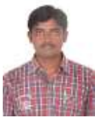
M.Tech, Assistant Professor, Dept. of Mechanical Engineering