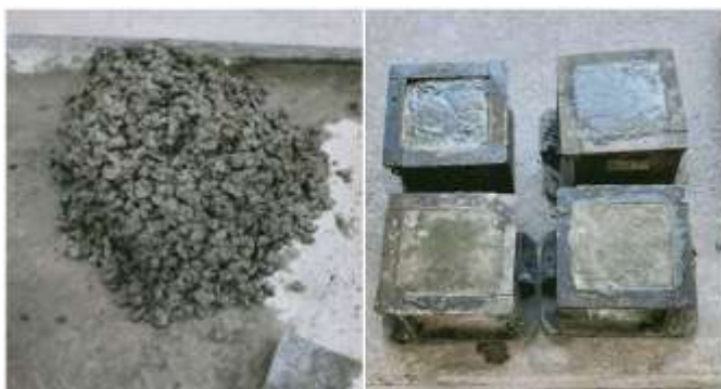
Fig -2: Specimen Preparation

The cubes were designed having dimensions 150mm X 150mm X 150mm. The M25 grade concrete was prepared with copper slag as a replacement of fine aggregate in various proportions i.e. 20,30,40,50,60&70% by hand mixing then casted cubes are then unmolded and was cured for 7days and 28days.