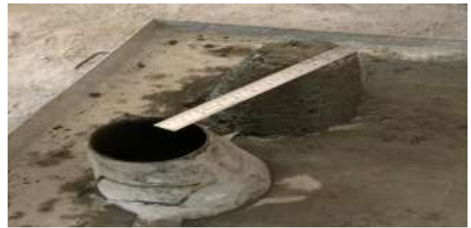
Fig -3: Slump Cone Test

The Slump Cone apparatus for conducting the slump test essentially consists of a metallic mould in the form of a frustum of a cone having the internal dimensions as : Bottom diameter : 20 cm, Top diameter : 10 cm, Height : 30 cm and the thickness of the metallic sheet for the mould should not be thinner than 1.6 mm.