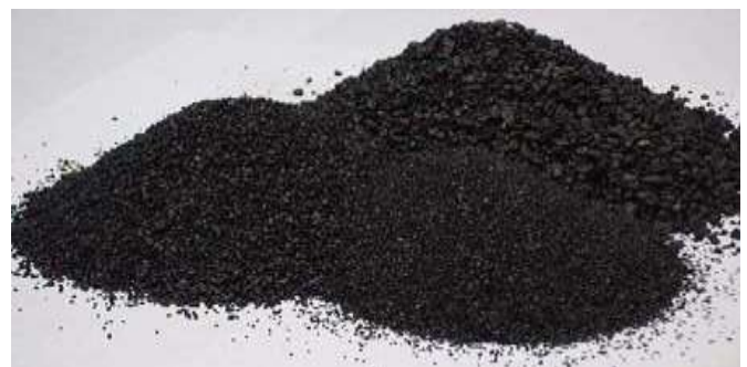
Fig -1: Copper slag

Approximately 24.6 million tons of slag is generated from the world copper industry revealed the various regions of copper slag generation depicted in Table1 [6].