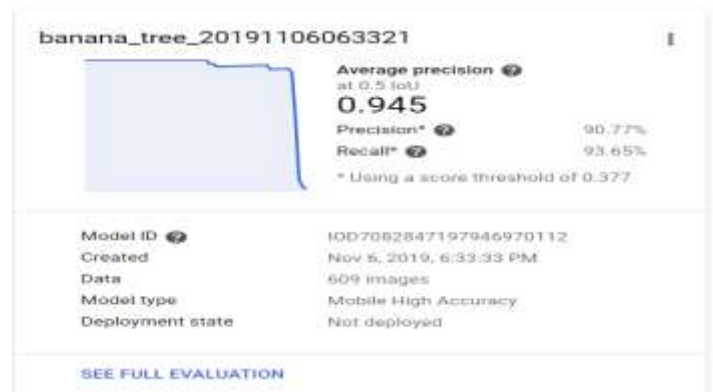
Fig -4: The average precision and recall for Banana Tree

In the training of data, initially, 600 images of different crops, their leaves, fruits, and different insects are trained in the Google cloud data training platform.