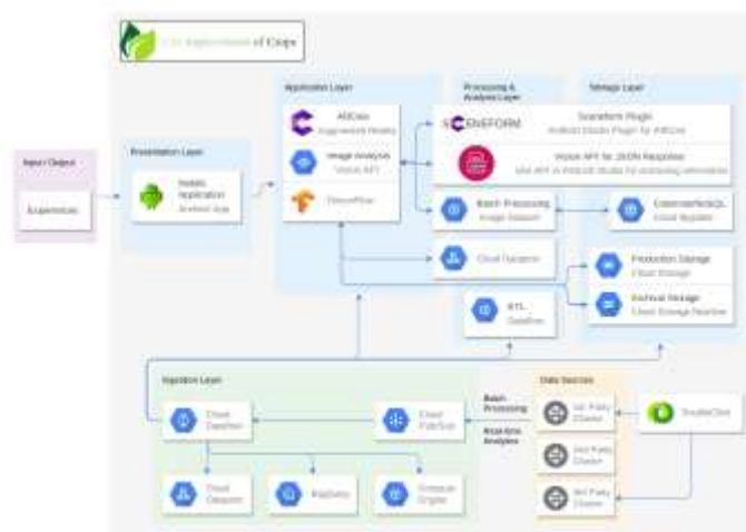
Fig -2: System Architecture

The system uses AR Core, vision API, Tensor Flow, and android modules. For the backend purpose system uses AR Core, vision API, Tensor Flow and for the frontend, android development kit used.