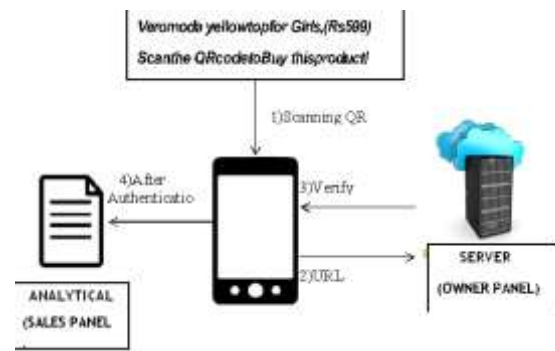
Figure : Flow of QR code generation.