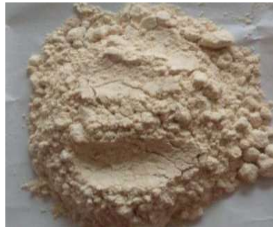
Fig -2 : Jackfruit seed powder

The jackfruit seed were collected from locality. The collected seeds were thoroughly washed using distilled water and dried for 48 hours in hot air oven. Then the seeds were grained to fine powder. The powder was sieved using 0.45 mm mesh and stored in an airtight container to prevent the entry of moisture into it and to avoid loss of its activity. This fine powder was used as coagulant for this analysis.