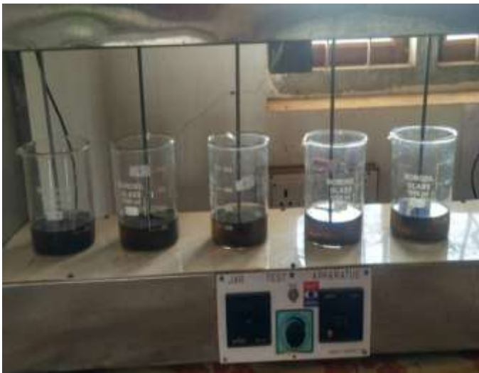
Fig - 4 : Jar test apparatus