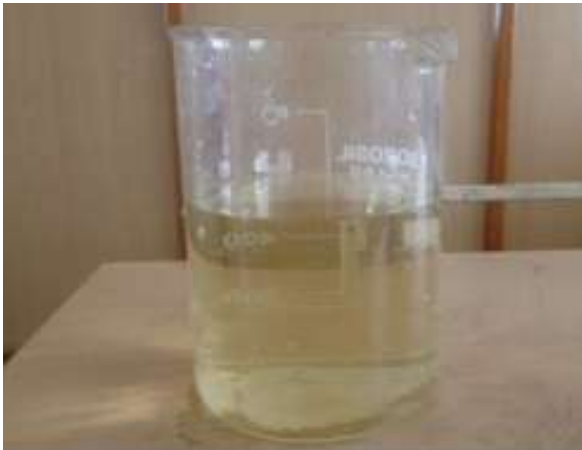
Fig -1 : Image of sample

The effluent was collected from an Aluminium powder coating industry at Thrissur. The samples were collected in sterilized bottles and were preserved in the refrigerator during storage. Initial characterization of waste water like pH, alkalinity, acidity, turbidity; TSS, TDS, Al ions, etc were determined.