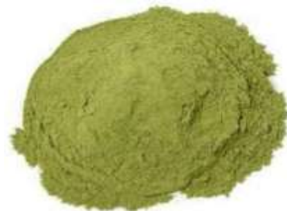
Fig -3 : Guava leaf powder

The guava leaves were collected from locality. The collected leaves were thoroughly washed using distilled water and dried for 48 hours in hot air oven. Then the leaves were grained to fine powder. The powder was sieved using 0.45 mm mesh and stored in an airtight container to prevent the entry of moisture into it and to avoid loss of its activity. This fine powder was used as coagulant for this analysis.