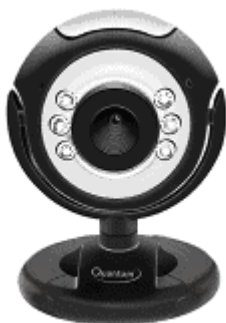
Fig.4: Web camera

The term webcam may also be used in its original sense of a video camera connected to the Web continuously for a long time, rather than for some amount of time, generally supplying a view for anyone who visits its web page over the Internet. Some of them, for example, those used as online traffic cameras, are more costly, rugged video cameras.