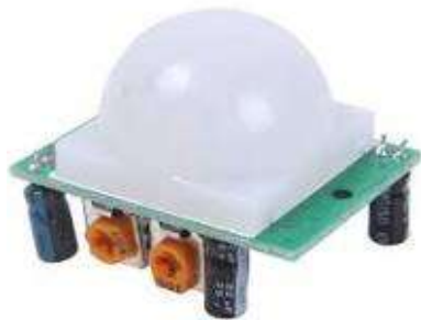
Fig-3: PIR Sensor

The sensor in the motion detector is actually split into two halves. The reason for that is to detect the motion (change) not average IR levels. The two halves are wired up so that they cancel each other out. If one half sees more or less IR radiation than the other, the output will change from high to low or low to high. This PIR sensor is used to detect whether the animal has left or entered the area range of the sensor.