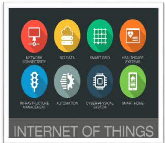
Fig - 1: Internet of Things

Today, in worldwide IoT Technology is among five prime technologies as per the Gartner’s Chart. Which means, it is widely used in various sectors in various roles either it is in smart homes or vehicle tracking, kids and old age people monitoring or daily routine job. Nonetheless, at present the reality is that these segments hire several IoT enabling devices, and future is already fragmenting the new revolution.