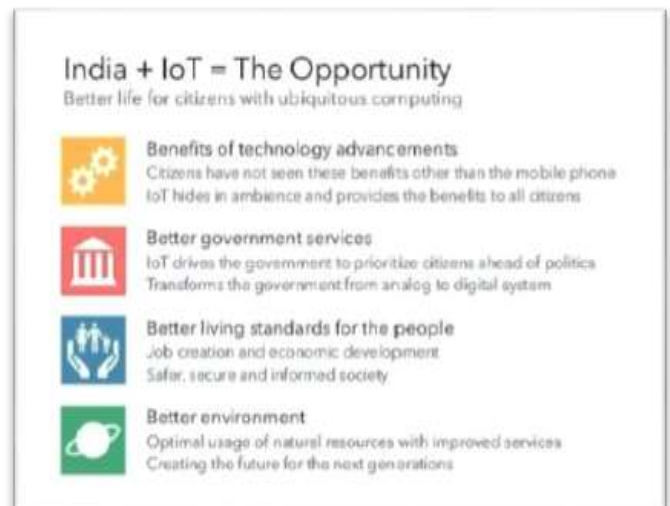
Fig - 2: IoT Future in India

Government initiatives, supporting environment, good living standards and increasing approval of smart applications plays the vital roles in the growth of market. According to the report of COMSNETS in 2015 [1], Government think about to invest in IoT for developing approximate 100 Smart cities its approximate proposed cost is Rs.7060 crores.