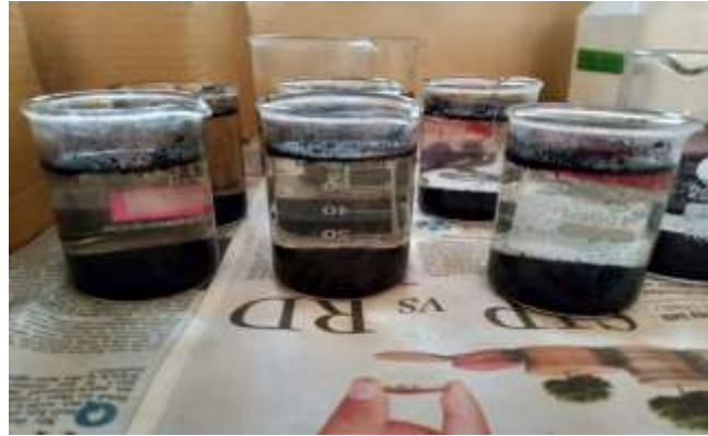
Fig.2 Water samples coagulation with rice husk ash