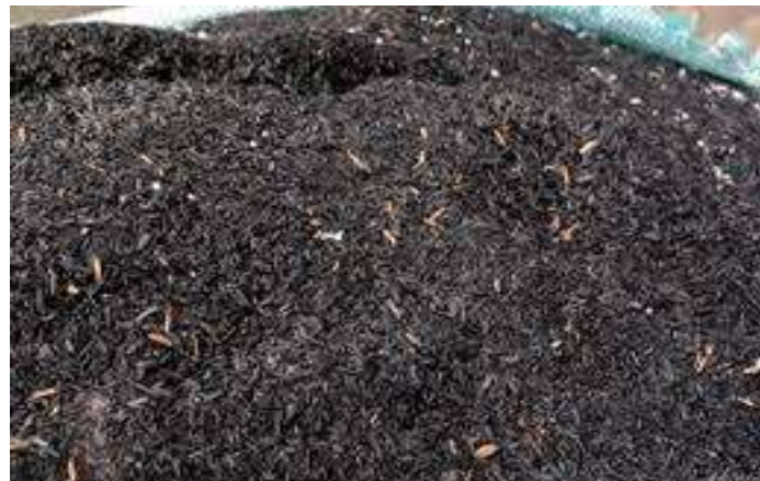
Fig.1 Rich Husk ash

Differences in varietal characteristics have significant effects on the chemical properties of rice husk the basic properties of rice husk are as follows: