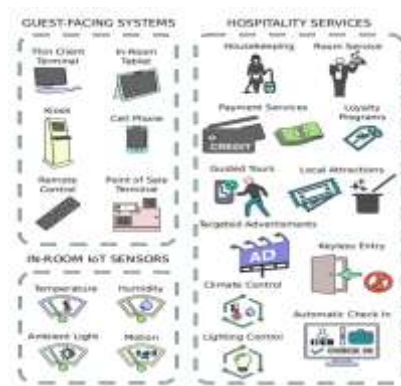
Fig -1: Modern Hospitality services