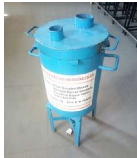
Fig -3: Developed Slicing Machine