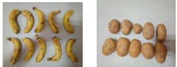
Fig -1: Sample for determination of Engineering Properties

India is second largest in production of potatoes, onions, etc. Amongst fruits, the country ranks first in production of Bananas. Slices are generally used for chips or wafers making. Potato and Banana chips have great market demand as compare to other. Hence Banana and Potato is selected for development of slicing machine & its performance evaluation. Most used variety for chips making for Banana are Dwarf Cavendish, Basrai, Robusta, Lal Velchi, Safed Velchi, Rajeli Nendran, Grand Naine, Shreemanti, Red Banana. Most used varieties of Potato chips are sindhuri, chandramukhi, Kufri sindhuri M Kufri Chipsona, Kufri Chandramukhi, Kufri Lauvkar.