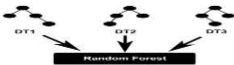
Fig -2: Working of Random Forest

RF brings along many decision trees to ensemble a forest of trees. The RF methodology relies on an algorithmic approach within which each iteration involves choosing one random sample of size N from the data set with replacement, and another random sample from the predictors without replacement. Then the data obtained is partitioned. The other data is then dropped. These steps are repeated certain times depending on how many trees are needed. Finally, a count is made over the trees that classify the observation in one category. Cases are then classified based on a majority vote over the decision tree.