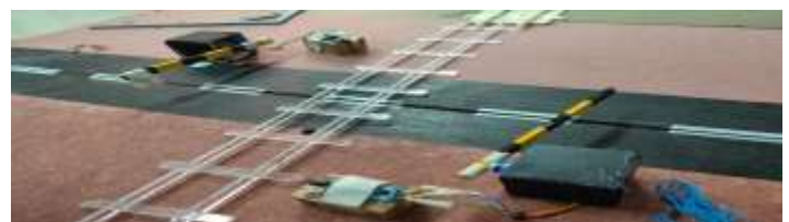
Fig 3.1Level Crossing