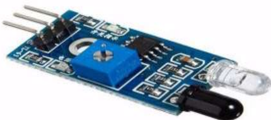
Fig 4.1.1 IR sensor