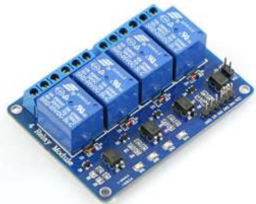
Fig 4.2.1: Relays

A relay is an electrically operated switch. It consists of a set of input terminals for a single or multiple control signals, and a set of operating contact terminals. The switch may have any number of contacts in multiple contact forms, such as make contacts, break contacts, or combinations thereof.