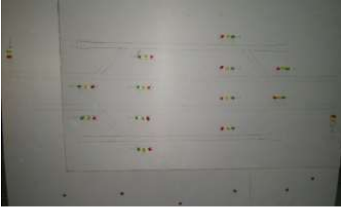
Fig 5: Scada Board