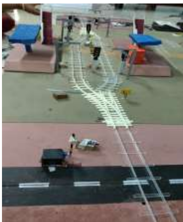
Fig 5.1.1: Project Construction