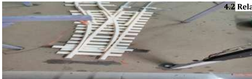
Fig 4: Interlocking