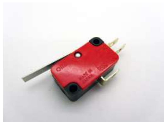
Fig 4.3.1: Limit Switch