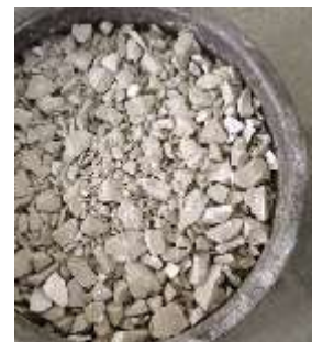
Fig -1: Ceramic waste