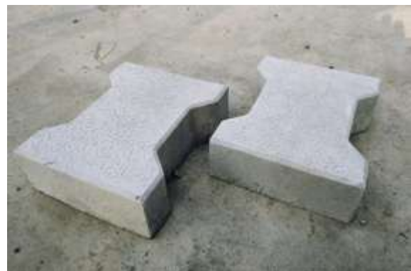
Fig -1: Paver blocks

There are various types and shapes of mould used in the manufacturing or casting of paver blocks. In this case we are used zigzag mould and I shape mould.