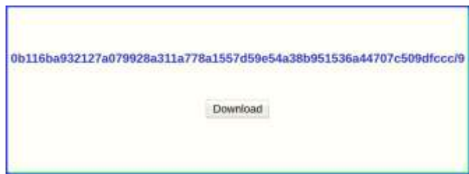
Fig 2: Generated Merkle Root