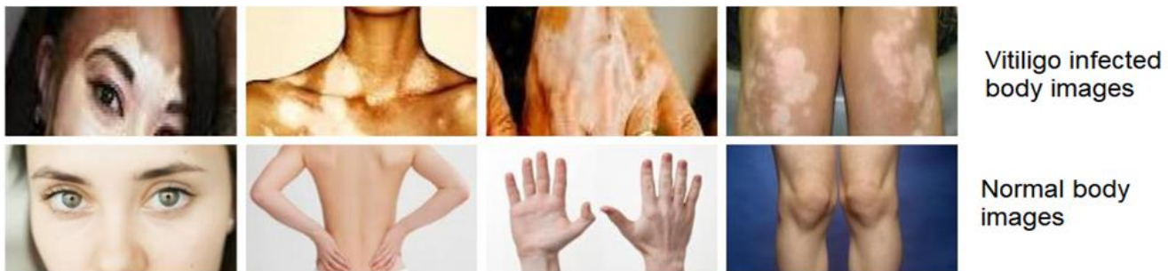
Fig-1: Sample images of Vitiligo infected body images and normal body images

On the basis of which we have categorized them into two classes, one is vitiligo infected lesions and another is the normal body parts. In the dataset, there were 368 images of vitiligo infected lesions and 328 images of normal body parts are shown in figure 1 as given below.