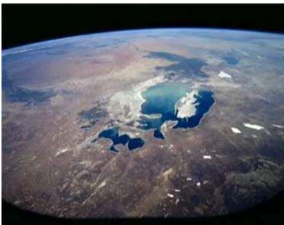
Figure -1b: SHRINKING OF ARAL SEA (1997)