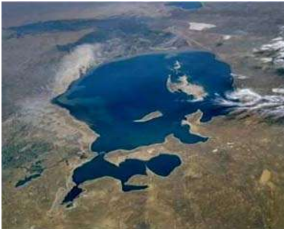
Figure -1a: SHRINKING OF ARAL SEA (1985)