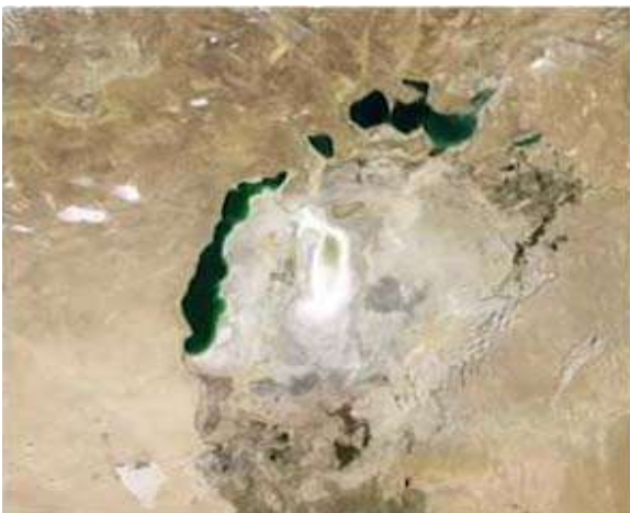
Figure -1c: SHRINKING OF ARAL SEA (2009)

While comparing the photograph of 1985, 1997 and 2009, shows that the kind of human development that took place over the decades have blocked the water channels that were originally reaching the Aral Sea, thus reducing the water content reaching the sea year by year.