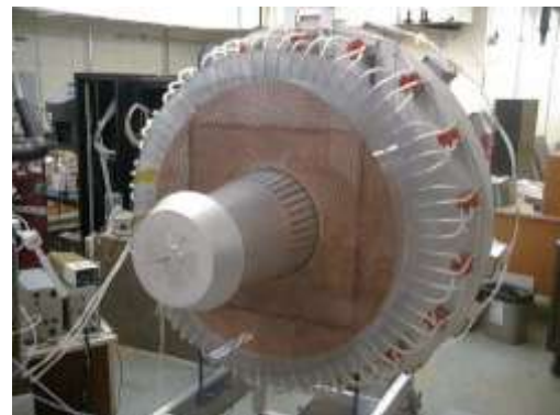
Figure 3: Front View of Mark VI PIT.

After a long pause for many years, work started again with a notional plan for Mk VI (Fig. 3), which would be electrically indistinguishable from Mk V, with a couple of changes. The Mk VI valve uses an electromagnet instead of a permanent magnet, and another, intricate diaphragm for the poppet, planned to give longer life. The valve is mounted on a taller arch before the coil, which is anticipated to give better gas dissemination.