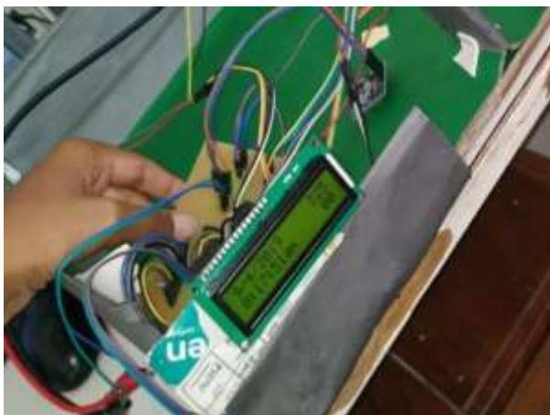
Fig 3. Sensor reading