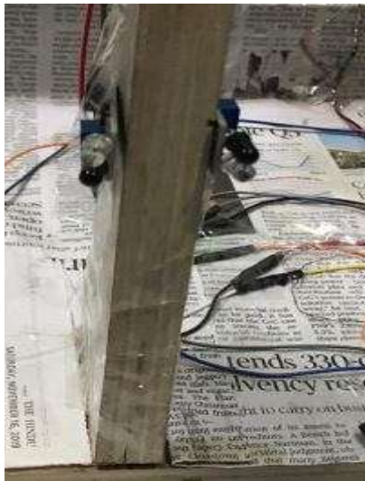
Fig 2. Sensor connection