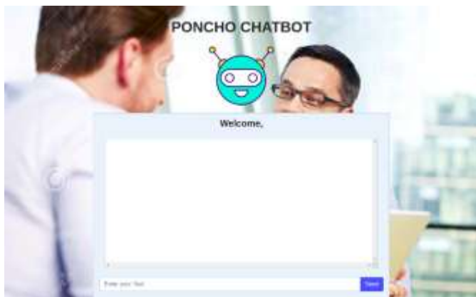
Fig -2: The UI when user just enters the chat

The User Interface (UI) is a very simple and familiar looking design. It looks and works like any other major messenger platform such as WhatsApp and Facebook Messenger. The UI was built using HTML, CSS and JavaScript. We have used Bootstrap to make the UI much easier to customise. Fig. 2 shows the UI when the user just boots up the chatbot.