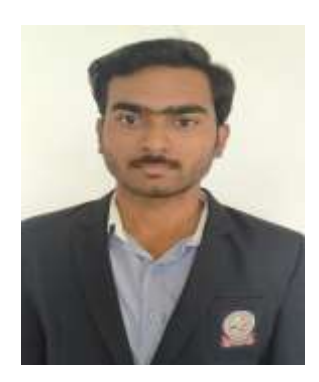
Pursuing B.E. in Electrical (Electronics & Power) Engg. In DES college of engineering & technology from S.G.B.Amravati University, India.

Pursuing B.E. in Electrical (Electronics & Power) Engg. In DES college of engineering & technology from S.G.B. Amravati University, India.