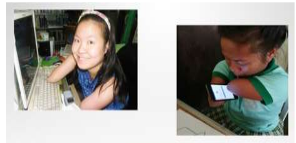
Fig - 1: Handicapped Students

It examines the evidence and the assumptions underlying the problem.