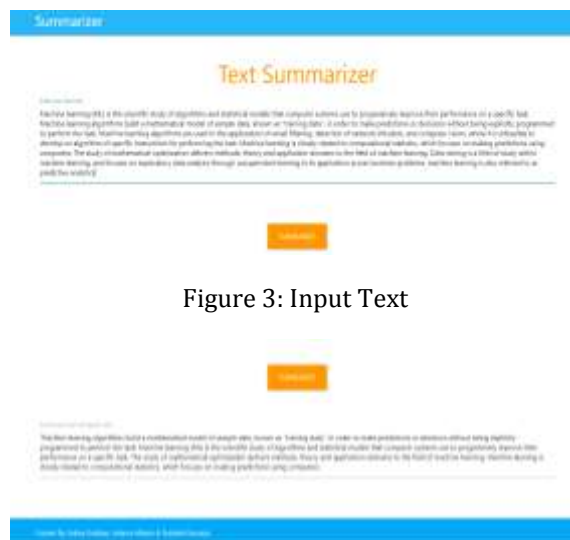
Figure 3: Input Text