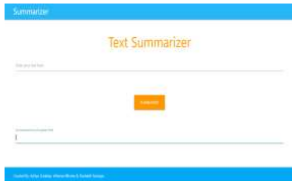
Figure 2: User Interface

The framework has built up a programmed text summarization framework utilizing characteristic language handling system for example semantic anchoring in blend with highlight extraction utilizing fluffy rationale and treatment of relationship of sentences. It has utilized a dataset of 250 little estimated reports and 250 medium-sized records in space of sports and specialized from BBC news corpus for testing the exhibition of the executed summarizer. TextRank utilizes the instinct behind the PageRank calculation to rank sentences TextRank is an unaided strategy for figuring the extractive rundown of a text. No preparation is essential. Given that it's language autonomous, can be utilized on any language, not just English. Right now, utilized as the comparability measure, the cosine likeness. We convert sentences to vectors to register this similarity.