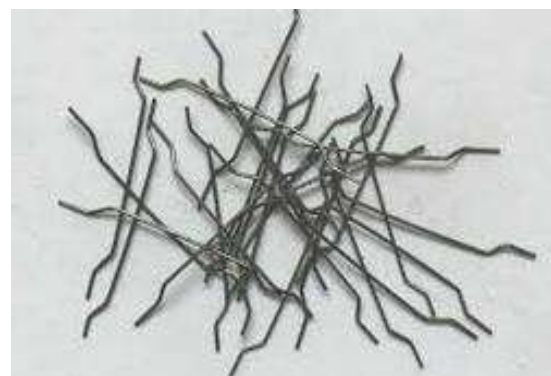
Fig -3: Hook end steel fiber.

Steel fiber having low carbon and hook end type were used. The steel fiber which is used in concrete is of density 7900 kg/m 3 . The steel fibers can be of any shape like a crimped wire, hooked or a flat and are described as a parameter called aspect ratio. Steel fiber properties such as, crack resistance and increase in toughness are dependent on the mechanical properties of the fiber, bonding properties of the fiber and matrix, as well as the quantity and distribution within the matrix of the fibers. Steel fibers can be defined as discrete, short length of steel having ratio of its length to diameter (i.e. aspect ratio) in the range of 30 to 150. The addition of steel fibers reduces the workability of the concrete. The steel fibers have dimensions of 0.45 x 25mm, aspect ratio of 45, and density of 7.85 g/cm 3 .