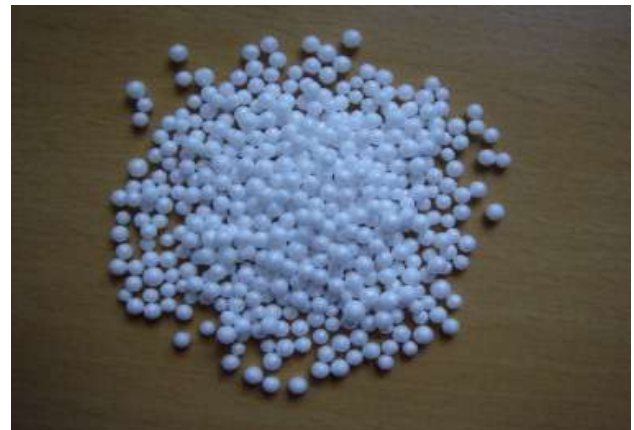
Fig -2: Crushed EPS in same sizes.

reviewing for railroad trackage. It is made by utilizing little lightweight Styrofoam or EPS balls as a total rather than the squashed stone that is utilized in normal cement. It isn't as solid as stone-based cement blends, however has different focal points, for example, expanded warm and sound protection properties, simple molding and capacity to be framed by hand with designing and development apparatuses.