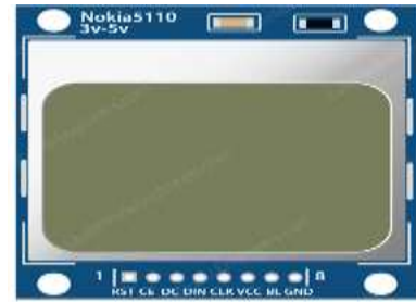
Fig -3: Nokia 5110

For this mechanism it require display for display the parameters of LED. The Nokia 5110 may be a basic graphic LCD screen for several applications. it's wont to display the brightness of LED as shown in fig. 3 [15]. It absolutely was originally intended to be used as a telephone screen. It has a capability to designed to run a graphic display of 48 rows and 84 columns. And another display is 16X2 LCD display has 2 rows and 16 columns. It used to show the power and voltage of LED [16].