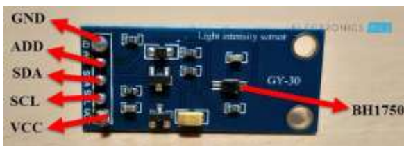
Fig -2: BH1750 light sensor module

The BH1750 Light intensity Sensor Module is based on the digital Ambient Light intensity measurable Sensor module IC BH1750FVI developed by ROHM Semiconductor. It is a digital IC within in-built function of capability of conversion in 16-bit luminance to digital converter. For transferring the info and communication with external devices like Microcontrollers, the BH1750 Ambient Light Sensor IC uses I 2 C Bus Interface protocol. It has few pins i.e. VCC, GND, SDA, SCL and ADDR. The SDA is used for serial data acknowledgement and SCL pin can provide serial clock pulse to arduino within single clock pulse 16 bit data are often transmitted as shown in fig. 2 [14].