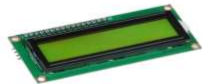
Fig -4: 16X2 LCD display