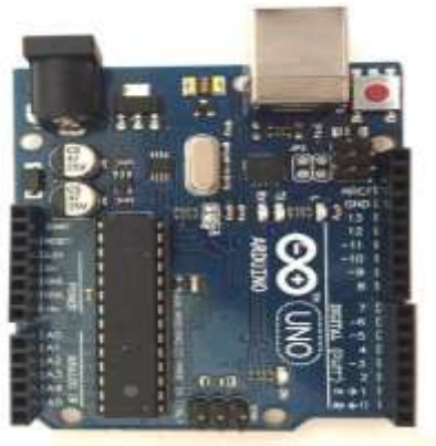
Fig -1: Arduino Uno