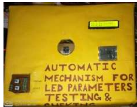
Fig -7: Experimental setup