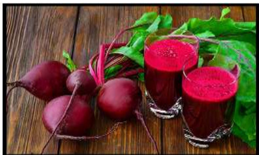
Figure: Beet Root and its Juice

Instrumentation includes glass material reactor fitted with ultrasonic generator and pH measurement system which is as shown in figure. During research work amplitude is on one fixed range and also the penetration on and off time is set by controller button. To start penetration of ultrasonic waves the main important point is to set the buttons accordingly. The prototype design for the experimental work is shown in above figure.