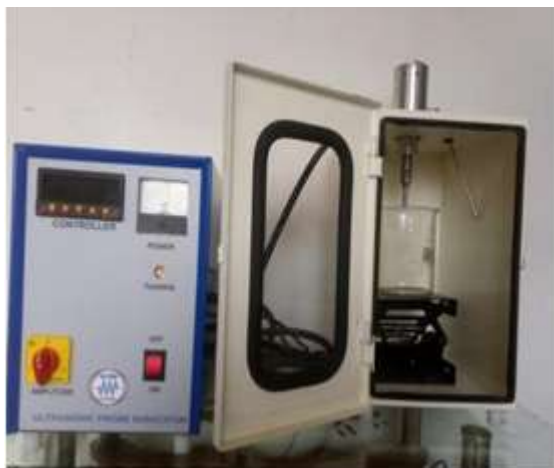
Figure: Photo of experimental setup