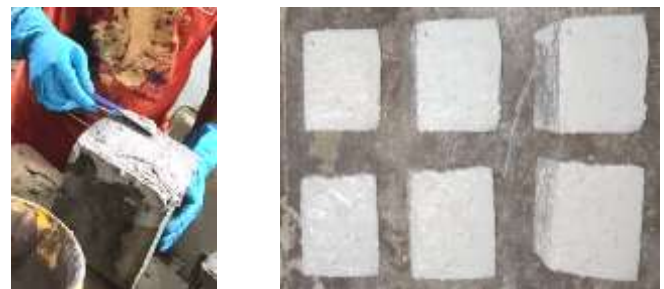
Fig 5.2 Repairing the cracked concrete cubes with epoxy

After coating of epoxy sikadur-31(IN) in cracked portion of concrete cubes surface of these cubes are plane by the help of proper use of scraper. These repaired cubes are placed in a room at ambient temperature for 24 hours for the setting of epoxy coated cubes.