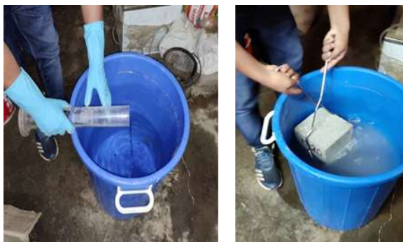
Fig 4.2 Acid test on concrete

This test is done to check the durability of concrete against adverse environment. In these study acid test has been conducted against sulfuric acid. By the help of sulfuric acid which dilute in distilled water sulphate attack has been tested. For the acid test take 5% concentration of sulfuric acid and dilute in distilled water and make a solution where concrete cubes to be immersed for 28 days. All cubes weighted before immerse in solution. After 28 days remove it from solution and weigh it again. We see weight of cube has been decrease at a certain amount. Again these cubes are test it in UTM for compressive strength test.