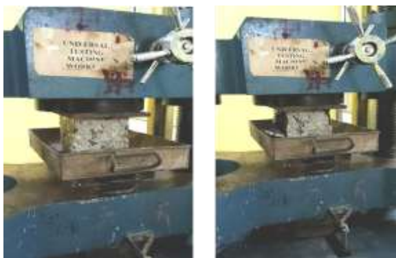
Fig 4.3 Compressive strength test of specimen after acid test