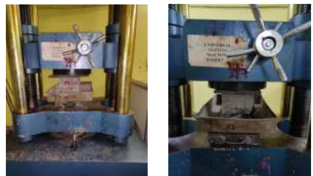
Fig 4.1 Compressive strength Test on UTM before & after failure

In this test we had prepared three cubes of control concrete specimen as per mix proportion which is calculated in mix design. For the testing of specimen place the cube on UTM and load will be applied at a rate of 4 KN/Sec. at a certain period specimen occurs failure. And finally we get the compressive strength of controlled concrete cube.