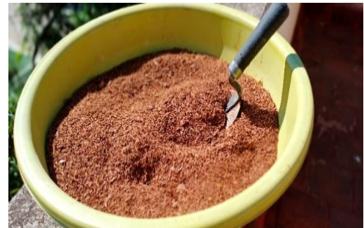
FIG - 5: Coco Peat

Coco peat has very high-water capacity, it can hold water by more than 7 times of its weight which helps in reduction of curing time and amount of water required for curing. It is an organic waste material and hence it is an ecofriendly material compared to sand.