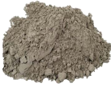
FIG - 2: Cement