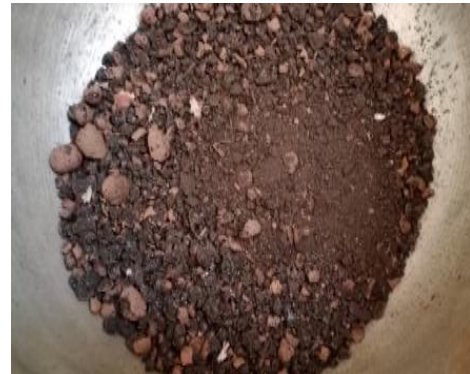
FIG - 4: Hydrotons