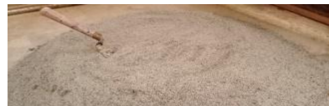
FIG - 1: Crusher Sand

Crusher sand is a substitute of river sand for concrete construction. The crushed sand is of cubical shape with grounded edges, washed and graded to as a construction material. The size of crusher sand is less than 4.75mm and the color of crusher sand is grey.