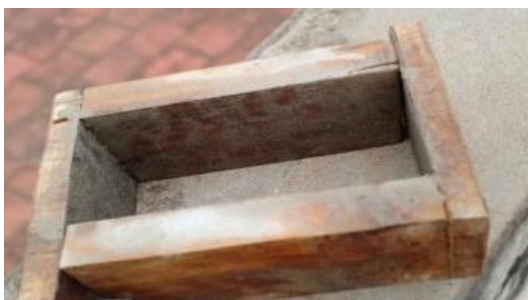
FIG – 6: Mold

All bricks were made using wooden mold, to produce brick of 190mm x 90mm x 90mm in size under a manual compaction preparation of bricks.