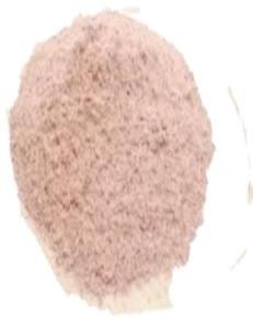
FIG - 3: Saw Dust

Saw dust is the waste product from wood industry. Saw dust is used as pore former to attain insulating properties of bricks. The incorporation of saw dust into the mixture has been proven as a key factor in altering quality. The use of saw dust as replacement of aggregate in bricks will improve the durability of brick with addition of PPC cement.