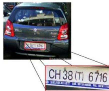
Fig 1. Localized number plate

background. State 3: Third, deliver them to an OCR system for recognition. In order to identify a vehicle by reading its license plate successfully, it is obviously necessary to locate the plate in the scene image provided by some acquisition system (e.g., video or still camera).