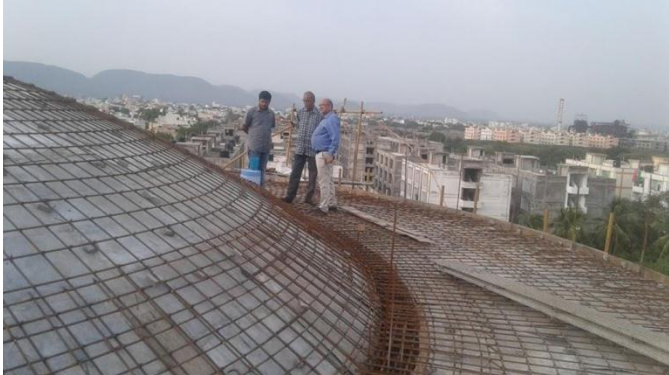
Fig : Showing design of the dome section

The weight of all permanent construction including domes, ring beams, shafts, walls, stair case, slabs and foundation are considered. The unit weights of materials are in accordance with IS: 875-1987. The unit weight of Concrete