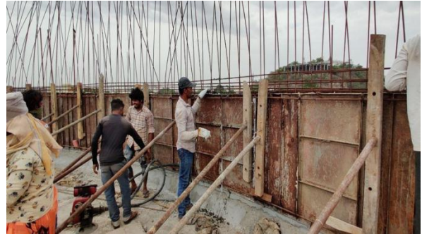
Fig: Showing RCC circular sidewall construction

operation is observed .All the results obtained from the field operation is shown in the log of bore.