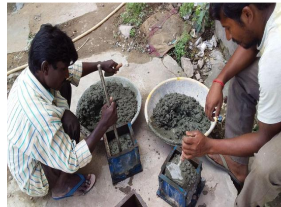
Fig: Showing Cube sample collection at site for testing