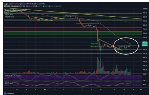
Fig -4.2: Hourly Based (Updated March.19)

The proposed system needs to predict Bit coin prices with more accurate results.