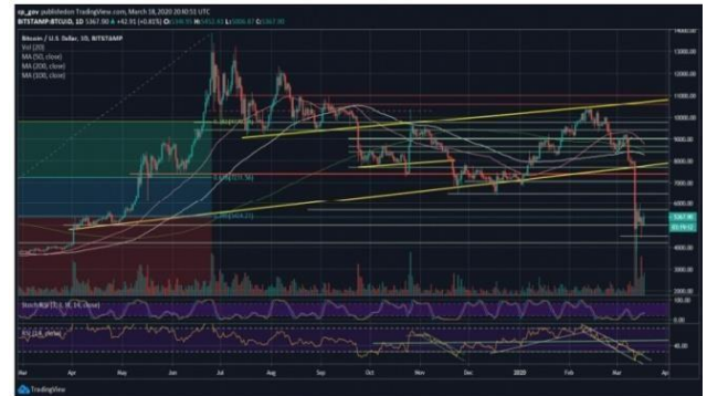
Fig -4.1: Day Chart

measure. SVR & LSSVR solves linear equations instead of a quadratic programming problem. It is preferred for large-scale regression problems that demand fast computation.