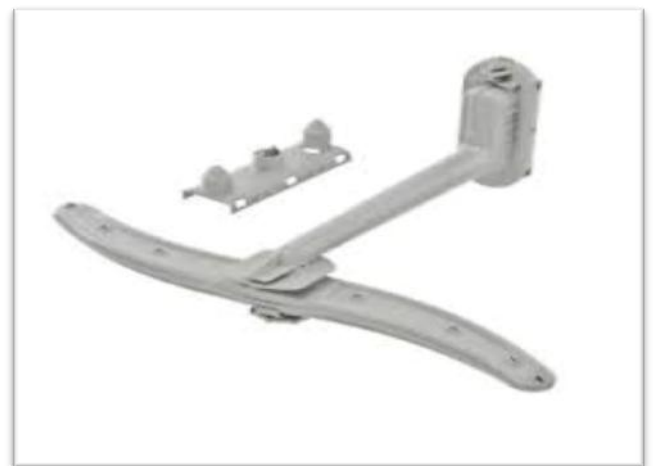
Fig 1 : Spray arm with holes

The figure of spray arm and water wall are as follow: