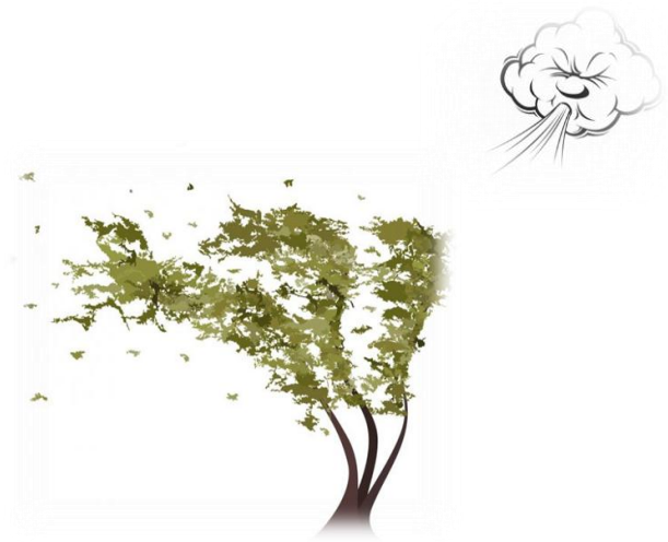
Fig -3: Wind vector