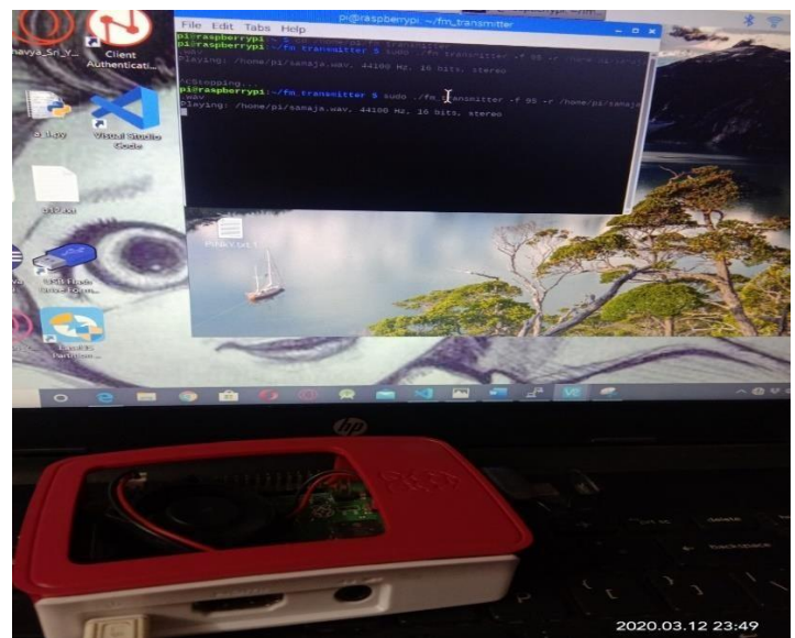
Fig2: Output screen

Outcome: Outcome is the well-established low-cost radio station at VR Siddhartha.