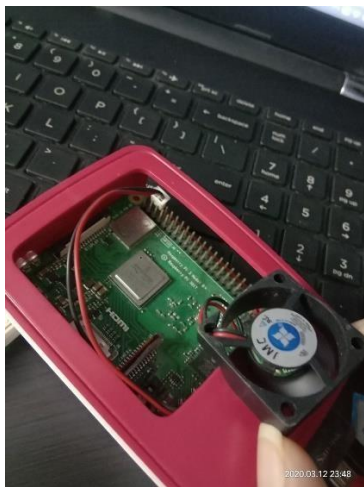
Fig4: Raspberry Pi