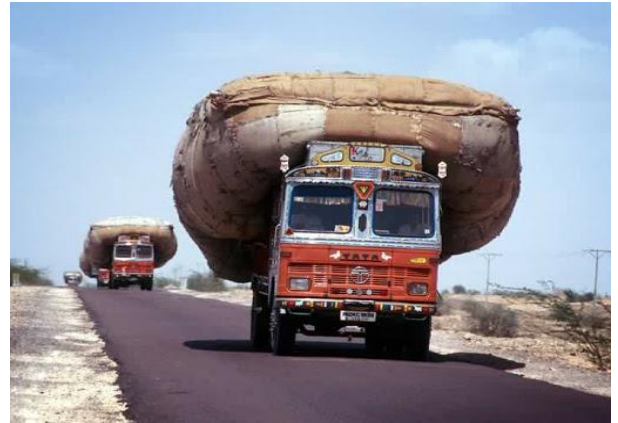
Fig - 1: Overloaded truck

Abstract - The paper addresses the need to include safety and fuel efficient measures in existing heavy vehicles (load carrying vehicles) with integration of Load cells, storage, GPS module, OBD and digital inclinometer. In the modern world, human mistakes sometimes lead to catastrophic events leading to loss of life and infrastructure. One such instance, sometimes intentional, is the overloading of vehicles. While sometimes the perpetrator gets away with it, more often than not this has led to accidents and loss of life. Through this paper, we want to bring in focus the importance of Load cells to curb the effects of such practices. Since policing is not possible at all stages of transport, the implementation of load cells is of utmost importance. Load cells can also be interfaced with ECU for theft control measures and increased fuel efficiency.