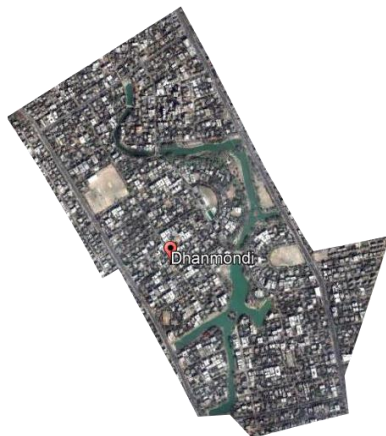
Map 2.1: Satellite image of Dhanmondi (2001)

“An existing lake breaks the monotonous layout of Dhanmondi, gives it a character. Initially the need for community facilities was totally ignored. There was only one school and one mosque within Dhanmondi. Gradual invasion of non-residential uses has drastically affected the quality and changed the character of Dhanmondi” [Hafiz 2004]