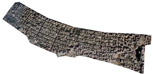
Map 2.2: Satellite image of Banasree (2020)

In this total area there is no designed open outdoor gathering space like play field, park or any other open space. Previously there were vacant residential plots so children used to play there and they worked also as social gathering space for people for that the lack of open space were not prominent in the early time. But in recent time the population density is growing rapidly in Banasree. Just 20 year back almost all the plots were vacant and now in 2020 rarely there is any vacant plot. The children has no place to play except the garage or the play zones in the restaurant. Some play in the roads but that is very risky. There is no space for a walk for the senior citizens, no open space to stroll and interact. It has totally become a concrete jungle. Now the need for open outdoor space has become acute.