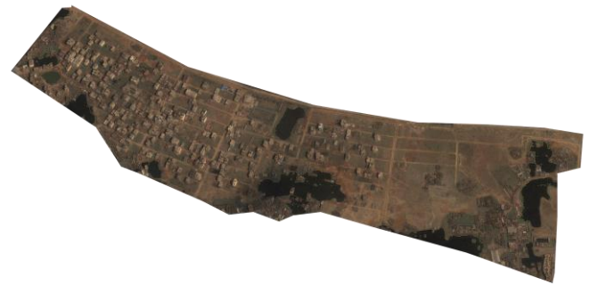
Map 2.1: Satellite image of Banasree (2001)

As a promising community there are a notable number of schools, colleges, medical centers, restaurants, food and shops outlets, etc. in Banasree. People from the surrounding communities come here frequently and that creates traffic congestion. Though the internal roads are quite spacious and road network is satisfactory but the traffic abrasion and lack of walkways create risks of accidents.