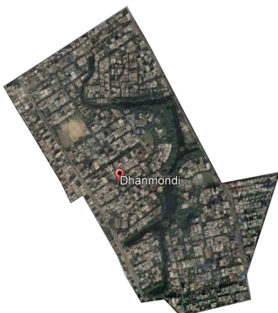
Map 2.1: Satellite image of Dhanmondi (2001)

Dhanmondi as an elegant location has always attracted the prosperous residents in the race of rapid urbanization and high demand for housing. The problems seen in Rampura because of haphazard development are also apparent in Dhanmondi. Because of the concentrated development it has reformed into a compact phenomenon and explosion of built structures from a planned low-density, low-rise residential area