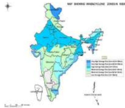
FIGURE None major cyclone that struck the mainland

The Meteorological Department of India (IMD) has applied the following criteria to classify low pressure systems in the Bay of Be alive gall furthermore the Arabian Sea as adopted by the World Meteorological Organization (WMO).