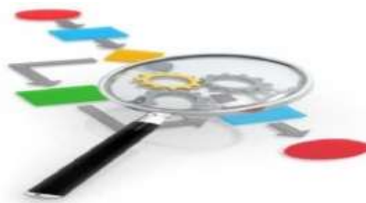
Fig 1: Testing process to find bug

For any company developing software, at some point pressure to reach the deadline in order to release the product on time will come into play. Additional pressure from project stakeholders, such as 'Marketing' will not want to delay the release date as significant effort and money may have already been spent on an expected release date.