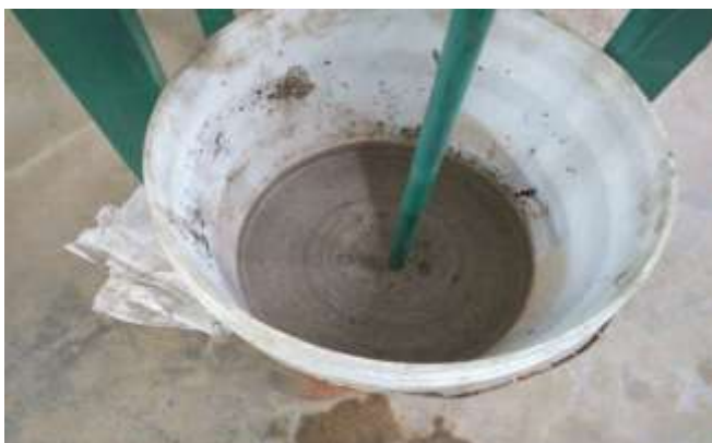
Fig -2: Oil- Saponin mixture formed as foam at the top

A laboratory model of soil washing tank is constructed for the purpose of washing of the sample. Optimum concentration of Saponin is taken for washing the soil. Saponin solution was prepared by dissolving 60g of Saponin powder in 2L of water. At a time 1 kg of soil is taken for washing. The soil surfactant mixture and water is taken in the container and the shaft of the washing system is centered exactly inside the container. The motor is switched on for the agitation of soil surfactant mixture to occur. The motor used has a speed of 960rpm. Higher the speed of rotation more is the adhesion between surfactant and soil. Inter particle contact will be more at higher speed of rotation. The duration of washing process is set for 20 minutes. After this period of rotation, motor is switched off and the mixture is allowed to settle for 1 hour for the filtrate to separate. After separation, the filtered soil alone is washed twice with water for the same duration at same speed of rotation. The washed sample is then subjected to air drying for 2 days. The FT-IR analysis of the sample before and after washing is done to assess the efficiency of Saponin in removal of the saturated oily compounds from contaminated soil sample.