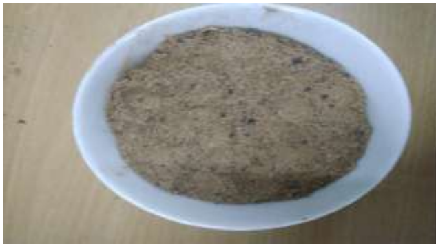
Fig -1: Saponin