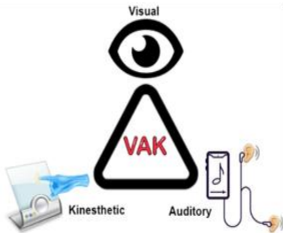
Fig 1 – VAK Style Module

devices like Large screen displays, user friendly, HD, lightweight, attractive design etc. [2][4].