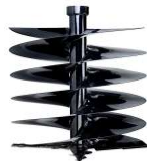
Fig 3:- Auger drill bit