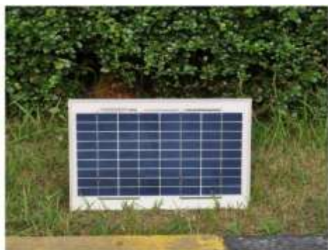
Fig 2 :- solar panel

Solar energy is the renewable energy resources. Solar energy can be directly converted to electrical energy by means of photovoltaic effect which is defined as the generation of the electro motive force as a result of the absorption of ionization radiation .Solar energy is the conversion of the light energy into the electricity. Here we are using photovoltaic cells, energy from the sun can be converted into electricity that we can use every day. Silicon is one of main materials that can be used in a photovoltaic cell to convert the sun’s energy into electricity. As sunlight strikes a silicon solar cell the electricity generated can be used to power a motor. A lens can be used to collect a large amount of light and concentrate it to hit a smaller solar cell.