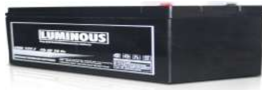
Fig 6:- Battery

Batteries seem to be the only technically and economically available storage means. Since both the photo-voltaic system and batteries are high in capital costs. It is necessary that the overall system be optimized with respect to available energy and local demand pattern. To be economically attractive the storage of solar electricity requires a battery with a particular combination of properties: