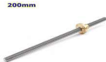
Fig 4:- screw threaded shaft