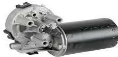
Fig 5:- dc motor