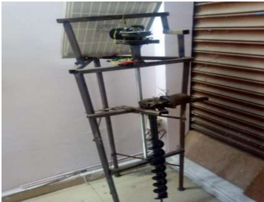
Fig 7:- over view of solar powered ground driller

The project makes use of solar panel, drilling bit, dc motor, battery, charge controller, screw threaded shaft. The project aim is building an solar power ground driller for agricultural purpose .Now a days the people are showing interest towards the agriculture. Due to the lack of the labor for doing agriculture some times the farmers will feel difficult for doing the work for sapling plantation. In this project we are using the battery for the rotation of the dc motor. The dc motor shaft is connected to the drill bit shaft when ever the dc motor rotates the drill bit will also rotates and move into the earth surface. Here we are using two dc motors one for the rotation of drill bit and another dc motor used for up and down motion of the drill bit. We are using the screw threaded shaft for moving the drill bit up and down motion .The battery is recharged by using the solar panel and also we are using the charge controller for controlling the charge of the battery. The total frame is made with the mild steel material and by using the welding process we are joining the material. A charge controller is used for controlling the charge in the battery.