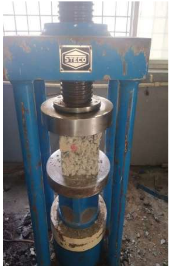
Fig.1 Compressive Strength test