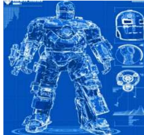
Fig-1: Blue print of Mark I

Iron Man suitcase armour is also powered heavy-metal set pieces. It is suit is built as a base for experimenting on newer and better transport features for Iron Man Suits, so that user would be able to don them faster than before. It specializes in smoother transport, and it is collapsed into a suitcase and can be deployed anywhere, allowing user access to the suit especially in a civilian environment[1]. The major developments shown in the Marvel cinematic universe, comprise of many models of different capabilities. The important and eye-catching predecessors are listed below, starting with the Mark I.