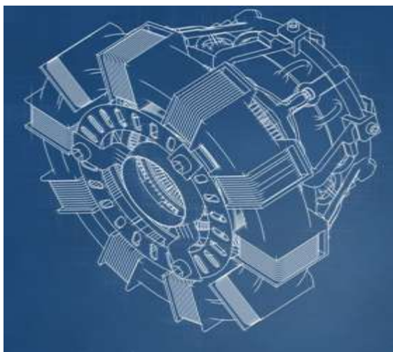
Fig-3: Sketch diagram of Arc reactor

The Arc Reactor is a fusion reactor. Fusion encompasses the nuclear reaction between two lighter nuclei to form a heavier one. But later the movie uses a Tesseract core as a cleaner energy source to retain the Arc reactor after Palladium toxicity. In the circular part of the Arc Reactor, there are highly energized units moving in a spherical path due to magnetic field acting, and thus producing energy through collisions. Palladium isotopes possess discrete nuclear properties, therefore the Arc reactor produces additional energy making it self-sustainable.