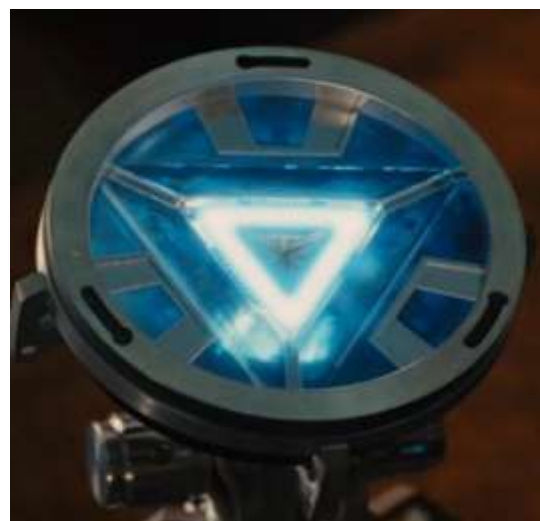
Fig-5: Arc reactor from Marvel movies.[5]

Due to its ability to absorb hydrogen, Palladium is accountable for cold nuclear fusion. Also, producing electricity with generation of minimal heat dissipation, resulting in more efficiency. The maneuver of the Arc Reactor is primed through the ionization of palladium through an electric arc, while the Gamma rays created, attached with the collisions of the particles produces a potential difference, thus producing current to flow in the reactor. However, it needs a tremendous amount of magnetic field to endure the reactor. The main drawback is that if we are producing that much energy in such a small place, it creates heats which is a fundamental law of thermodynamics and that heat would melt everything. This is one of the challenge in localizing energy and then distributing it, we require lots of coolant. This Arc reactor enables Iron man to shoot beam from his hands, which is known as the repulsor beams. The repulsors beams are the type of arsenal that uses particle beam technology to repel the opponent away as well as leaving burns, mortal wounds, and even gaping holes[4]. It operates by enchanting spare electrons and converting it to muons, which can deeply penetrate.