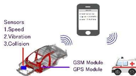
Figure 1. Accident detection

In the first part of the system, detecting the accident is based on the hardware parts. It contains three different sensors to detect the accident. The sensors used for the sensing mechanism are vibration sensor, speed sensor and collision detection sensor. The vibration sensor is set default with a valid amount of vibration that can occur while car is being driven. Whenever the accident occurs, the vibration level of the car gets drastically changed. This change in vibration is sensed by