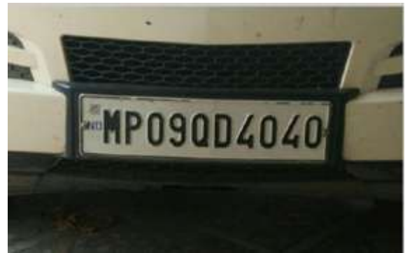
Fig-3: Image captured by camera. (Input image)

The picture of the vehicle whose number plate shown in image given below as fig 3 is to be recognized is caught utilizing an advanced camera of 13 megapixels. In this progression, the color image which contains a number plate of a vehicle is transformed into Gray-Scale. Here scientific morphology is used to detect the area along with Sobel edge operations that are utilized to calculate the edge boundary. After this, we obtain a dilated picture. At that point, infill function is utilized to fill the gaps with the goal that we get a reasonable binary image.