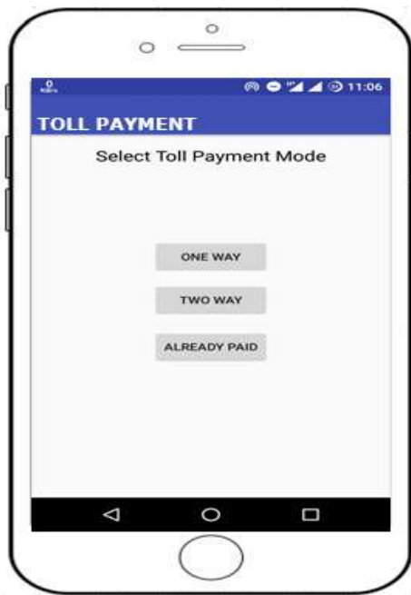
Fig.2: User mobile Application

Each vehicle will be provided by an RF ID tag containing an ID, this ID is unique for each vehicle and it is synchronized with license plate of the vehicle. RF ID tag will continuously emit RF signals. When the vehicle will reach at the toll booth the Ultrasonic sensor detect the presence of vehicle, RF receiver will detect these RF signals. The signals are amplified and are passed to Raspberry pi. USB camera is used by the concept of image processing the license plate of the vehicle is captured for the security purpose and stored in the database. Pi will check whether the user is valid or not, if valid the pi will intimate the gate control which is supported by a stepper motor. To avoid the time consumption a mobile application is developed that includes One-way, Two-way and Local option. By using wireless communication application can be used. Once the user provides specific input, respective amount is deducted from the account. If the RF ID is not verified the gate remains closed. LCD Display is used to see the status of the vehicle. Details like date, time, weight and id will be stored in the database.